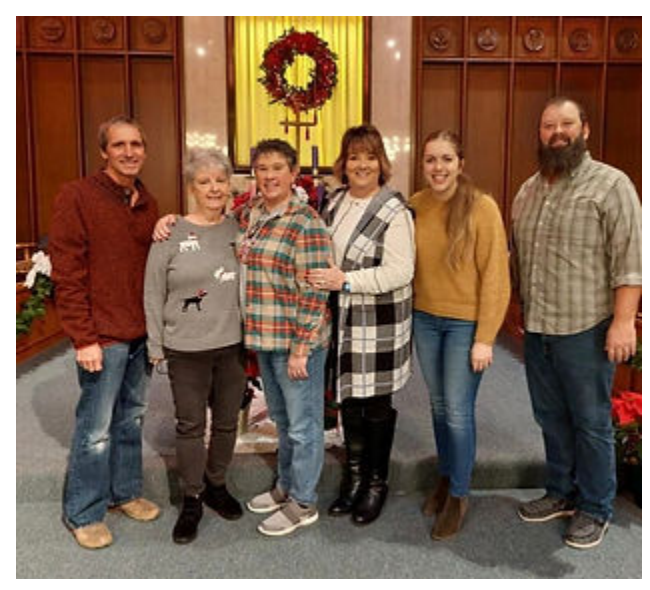
(not pictured: Joe Palan)

The Praise band hopes to continue putting tracks down, and time permit